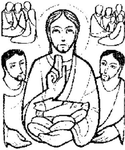
misioneros del sagrado corazon en el peru

Glorious God, your generosity floods the world with goodness and you shower creation with abundance. Awaken in us a hunger for food to sat- isfy both body and heart, that in the miracle of being fed we may be empowered to feed the hungry in Jesus' name. Amen.